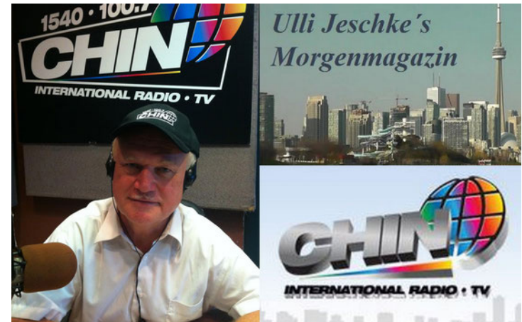
JEDEN SONNTAG MORGEN 7AM - 8AM CHIN1540AM